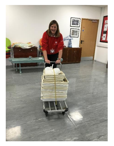
Teesmouth Field Centre rocks experiments on the move

St Joseph's RC Primary School, Middlesbrough – 2 rivers workshops Deaf Hill Primary School, County Durham – 1 rocks workshop Bader Primary School, Thornaby – 1 rocks workshop