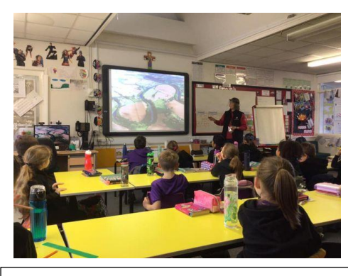
The River Tees Outreach Presentation

The Field Centre staff were partly furloughed for March and worked one day a week in the Field Centre Office. We visited St Therese of Lisieux RC Primary School to deliver a Rivers workshop. It was great to be back in the classroom again and to see the enthusiasm of the children. They made some excellent maps of the River Tees and showed a detailed knowledge of rivers in the 'Who wants to be a Millionaire' quiz.On office days the staff continued to develop advertising posters and to advertise the Habitats, Rivers and Rocks outreach workshops to schools. This advertising has resulted in many bookings for the Summer Term. The Field Centre will continue to work in this way until school visits are able to resume.