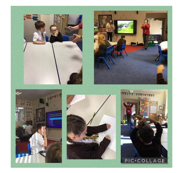
Delivering a rivers workshop at St Joseph's RC School, Middlesbrough