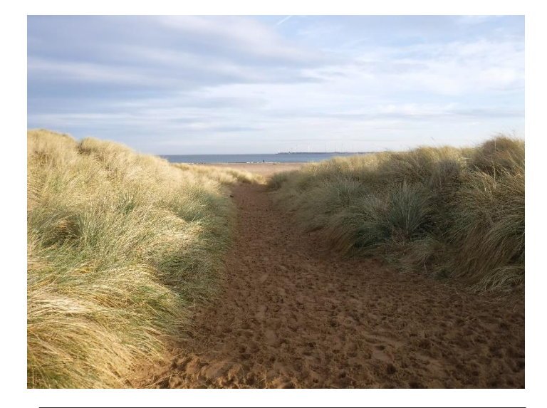
The path to Seaton Snook beach in the December sunshine