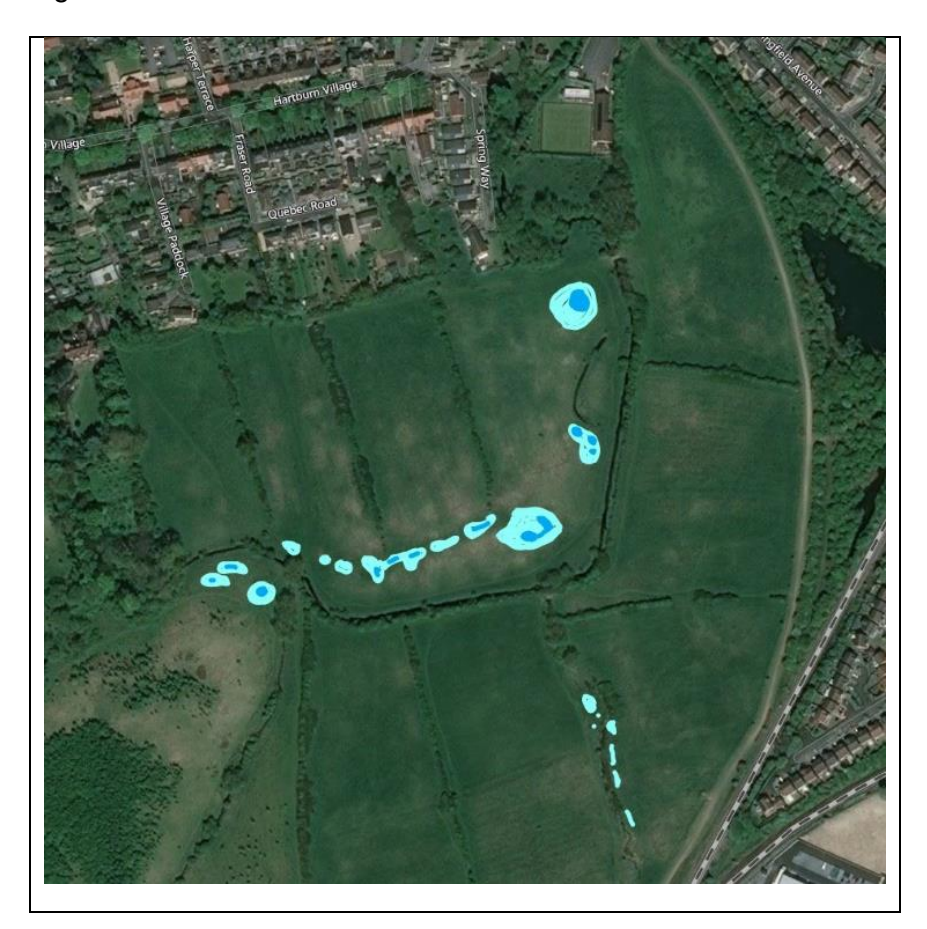
Figure 1. Ponds created in 2018.

Informal footpath alongside a length of the beck moved further away from the watercourse in 2018. Several, variously sized ponds created in 2018. Figure 1 shows the location of the ponds. NB: the southern group of ponds and the extreme three western ones fall outside of the LWS.