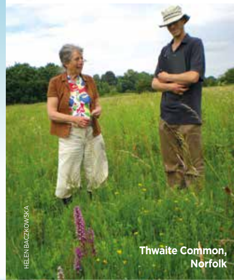
Thwaite Common, Norfolk