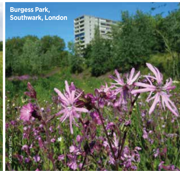
Burgess Park, Southwark, London