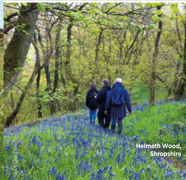
Helmeth Wood, Shropshire