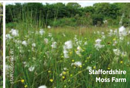
Staffordshire Moss Farm