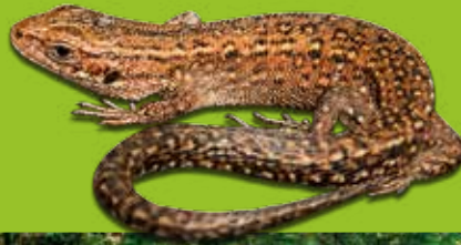
Hoe Common, Norfolk