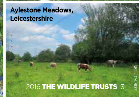
Aylestone Meadows, Leicestershire