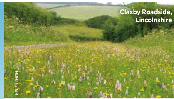
Claxby Roadside, Lincolnshire

They are identified and selected locally, by partnerships of local authorities, nature conservation charities, statutory agencies, ecologists and local nature experts, using robust, scientifically-determined criteria and detailed ecological surveys. Their selection is based on the most important, distinctive and threatened species and habitats within a national, regional and local context. This makes them some of our most valuable wildlife areas.