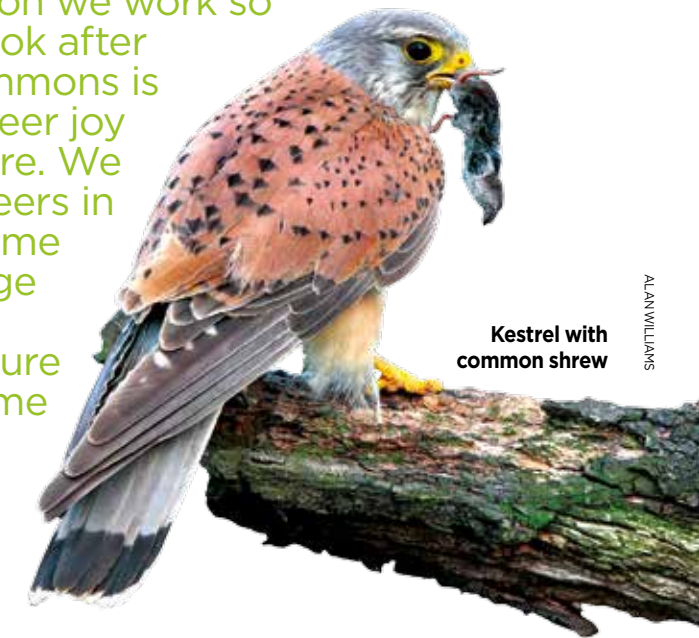
Kestrel with common shrew