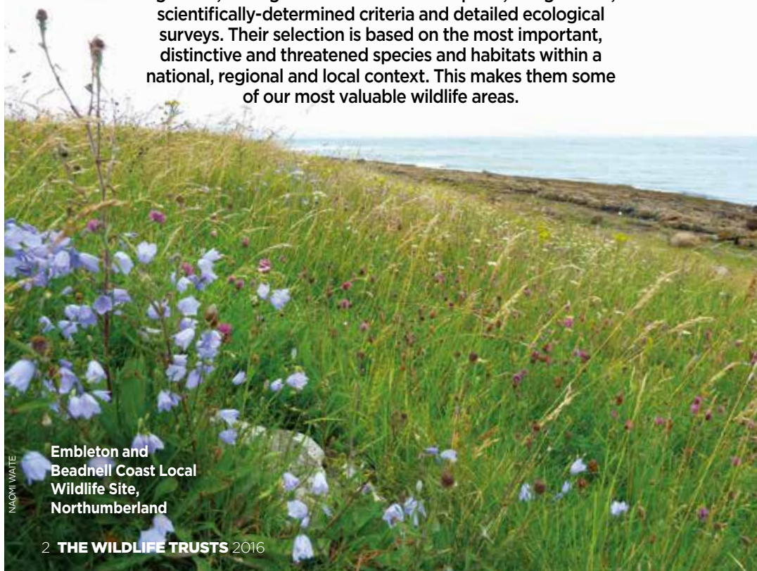
Embleton and Beadnell Coast Local Wildlife Site, Northumberland