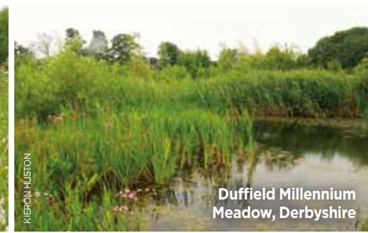
Duffield Millennium Meadow, Derbyshire